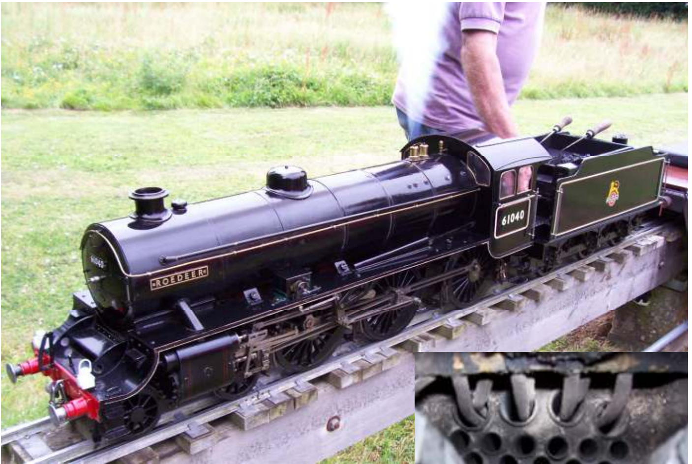
3 views of Steve Danby's 4-6-0 Class B1 to the Springbok design by Martin Evans.

Boiler tests continued during the last months and included are photographs of some of the locomotives that have been seen at the track.