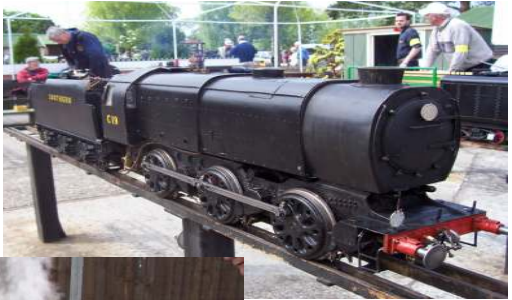
Right: Southern 0-6-0 Class Q1 "Charlie" class in the steaming bay