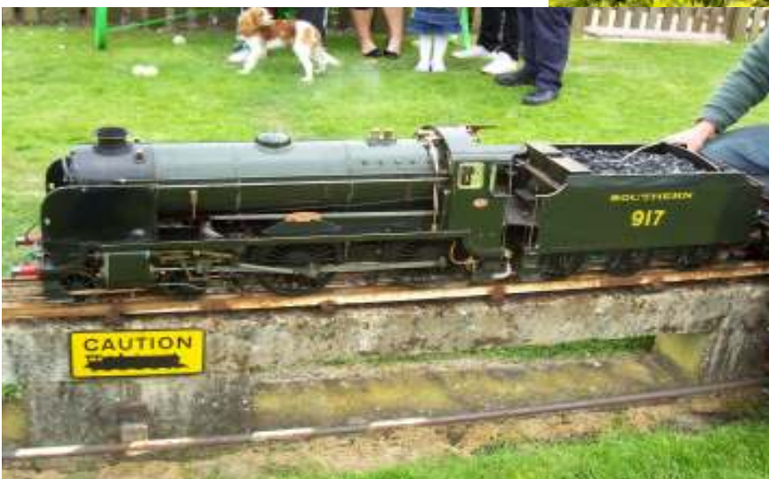
Left: 5" gauge Southern 4-4-0 V "Schools" class loco stopped awaiting a clear road