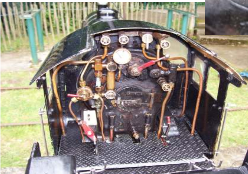
Left: A view of the cab controls