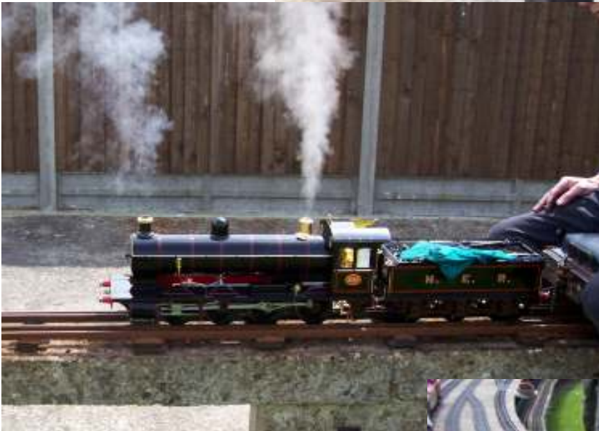
Left: 3.5" gauge "Netta" loco in action on the RMMES track at New Romney