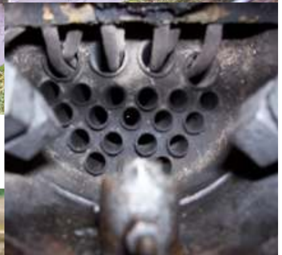
Above: Boiler front tube plate.