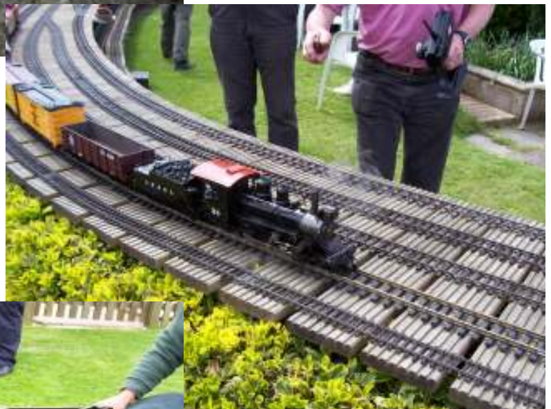
Right: The 16 mm track was in full operation with many locos in attendance most being radio controlled live steam .